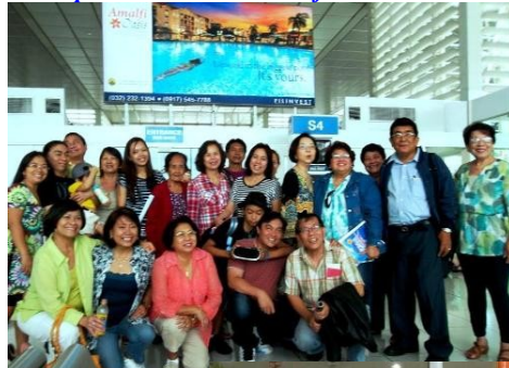
Airport arrivals... bound for where else?