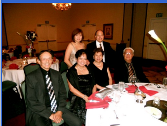
Contingent from San Diego ↑