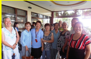
At the President's home