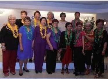
Some of the '61 and '62 graduates