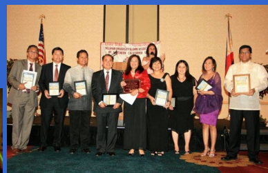
New officers ↑ for LA alumni