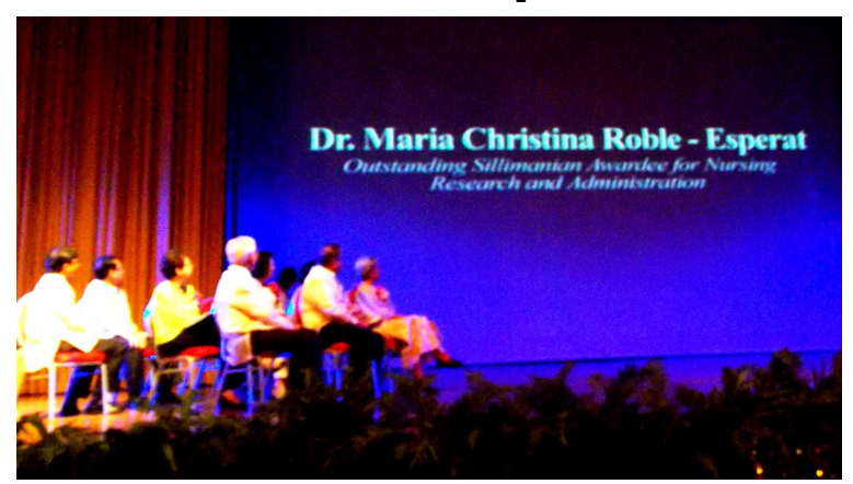
Aug. 28: 50th anniversary of the OSA awards instituted by President Cicero Calderon in 1962.